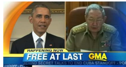
President Obama and Raul Castro gave simultaneous speeches on December 17, 2014

P.O. Box 546135, Miami, FL 33154 | T (305) 884-0441 | F (305) 260-4214 | www.echocuba.org